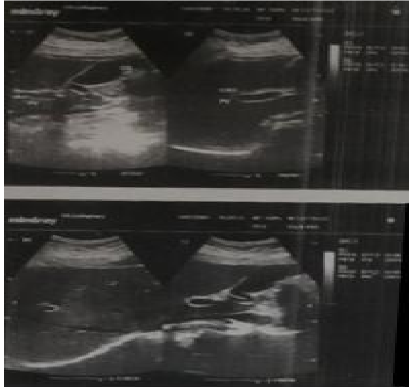
Fig. 2. The diameter of the liver's interior