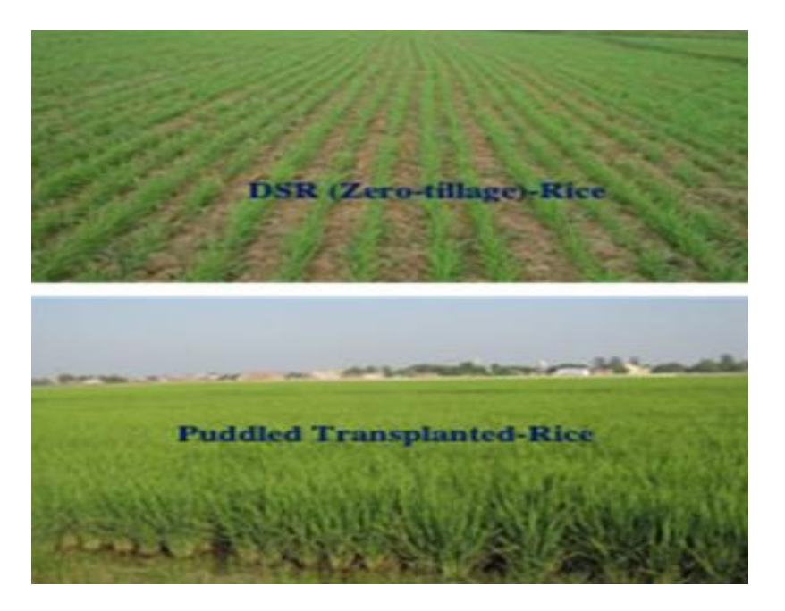
Fig. 2. Different methods of rice crop production in the IGP region

Pradhan et al.; J. Sci. Res. Rep., vol. 30, no. 6, pp. 543-557, 2024; Article no.JSRR.116827