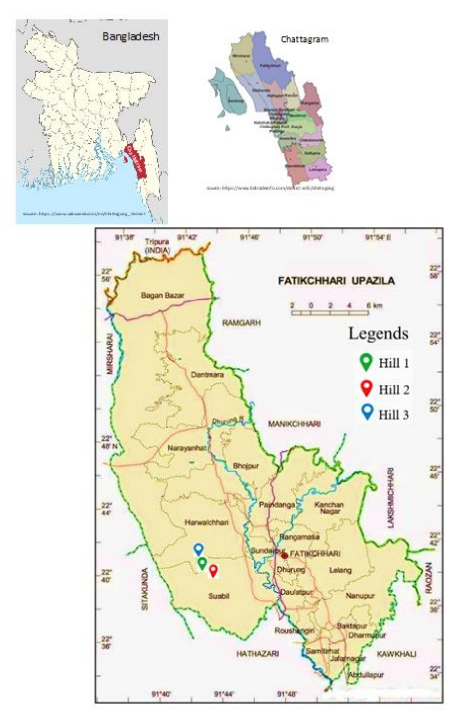
Fig. 1. Location of sampling sites

Hill 3, respectively, whereas the optimum pH range for tea cultivation is 4.5-5.5 [30]. The results showed that Hill 1 was in the best condition regarding pH for tea cultivation among the hills. Being cultivated for 10 years from 1972 to 1982, the Hill 1 is not currently under tea collection and left for quality restoration for several years. In contrast, Hill 2 soils were out of