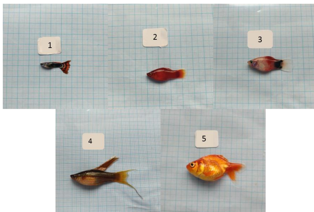
Fig. 1. Poeciliidae Fish

Based on the results of observations of its morphological characteristics (Fig. 1), it was found that guppies have a tail that varies in color with a dark body. The platy fish has an orange color with a small mouth. In molly fish, the body and tail are white and black and clear. The swordtail fish has a characteristic sword-shaped tail and a yellowish-black color. The goldfish has a bright orange color and does not have a dark color like the other four fish.