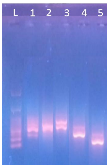
Fig. 2. Results of PCR-RAPD

The genomic DNA obtained from the isolation was then tested quantitatively by using a spectrophotometer to measure the purity of the sample DNA. The concentration of good DNA quality ranges from 1-10 µg/µl . The purity level of pure DNA isolates has a value in the range of 1.8-2.0 and was tested qualitatively by applying the identification, separation and purification of DNA fragments using agarose gel electrophoresis. When the level of purity is low, the primer attachment will be disrupted and the activity of the DNA polymerase enzyme will be inhibited [13].