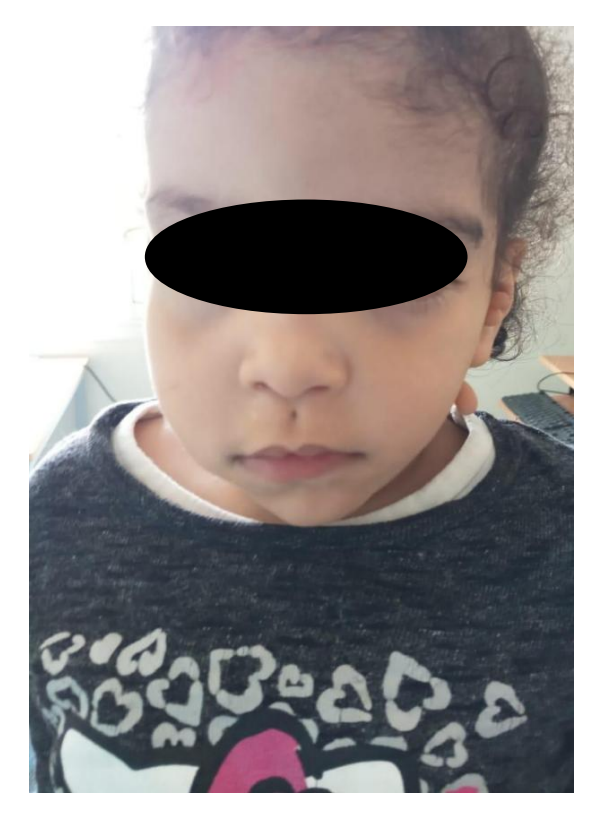
Fig. 1. Photograph showing the frontal view of the patient's face

had normal motor development. On clinical examination, there was facial asymmetry with hypoplasia of the left malar region, hypoplasia of the maxillary bone and the mandible, and a slight extension of the labial commissure to the left. Otoscopic There was no facial palsy. examination showed a grade 1 left microtia with preauricular tags and stenosis of the left external auditory canal. Ophthalmologic examination found a left limbal dermoid cyst along with a lower eyelid coloboma. Hypertelorism was present. An intraoral examination didn't show any oral lesions. the palate and the tongue, the buccal and labial mucosae appeared to be normal. A cranial nerve examination didn't reveal any abnormalities. A general examination didn't find any systemic diseases. We diagnosed the child with Goldenhar syndrome. The patient had a mild language delay. Her speech was not understandable. Hearing was assessed using auditory evoked potentials, and the child was found to have a left-sided hearing loss with a threshold of 40 dB. hearing Hearing was normal in the right ear. The patient was advised to use hearing aids and participate in speech therapy.