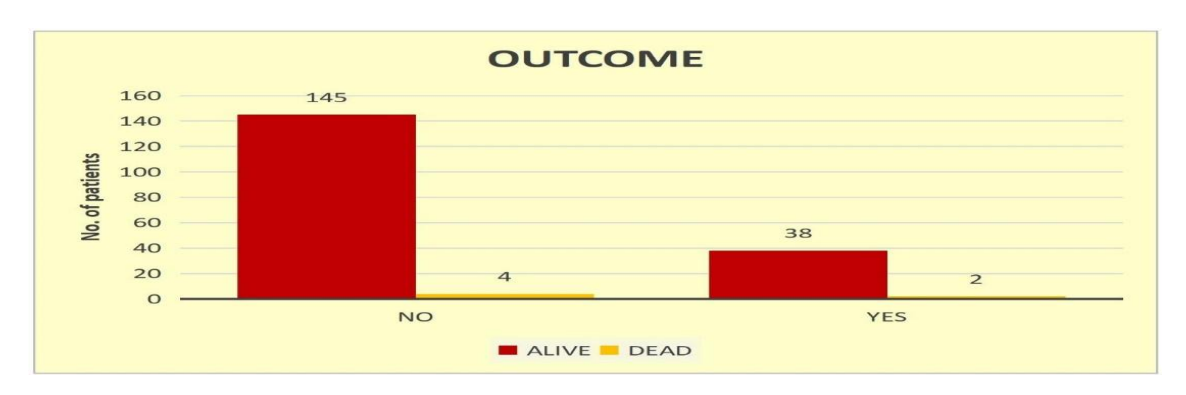
Fig. 2. Outcome of the enrolled patients in both groups (No= Group B, Yes = Group A) Table 1. Demographics of the enrolled patients in both groups