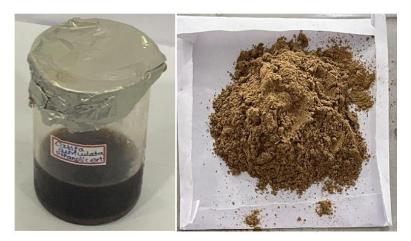
Fig. 1. Image showing the Synthesis Cassia auriculata ethanolic extract

of serum lysosomal enzymes and lipid peroxides [44].