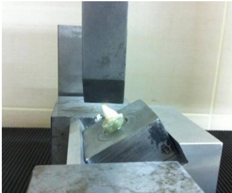
Fig. 3. Specimens were loaded at a universal testing machine until fracture occurred.