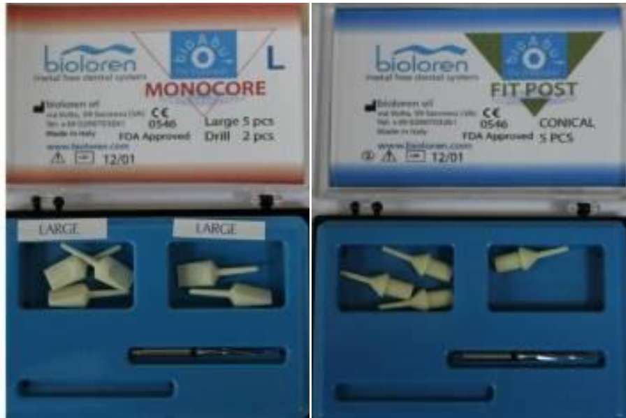
Fig. 2. MonoCore Fiber Posts and Fit Fiber Posts (Bioloren Metal FreeDentalSystem, Soronna, Italy)