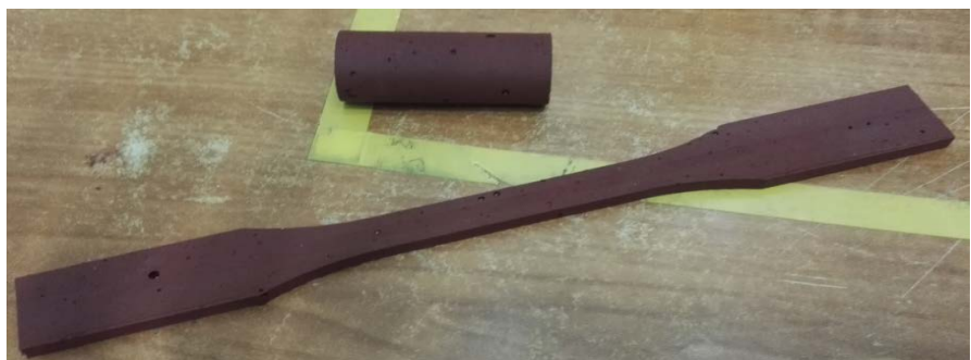
Figure 1. Bubbles in specimen.

In order to reduce the air entry in the process of glue mixing and glue transformation to syringe, a set of vacuum and glue device is manufactured, as shown in the Figure 2 . A vacuum tank is about \varnothing 350 mm, and height is about 500 mm