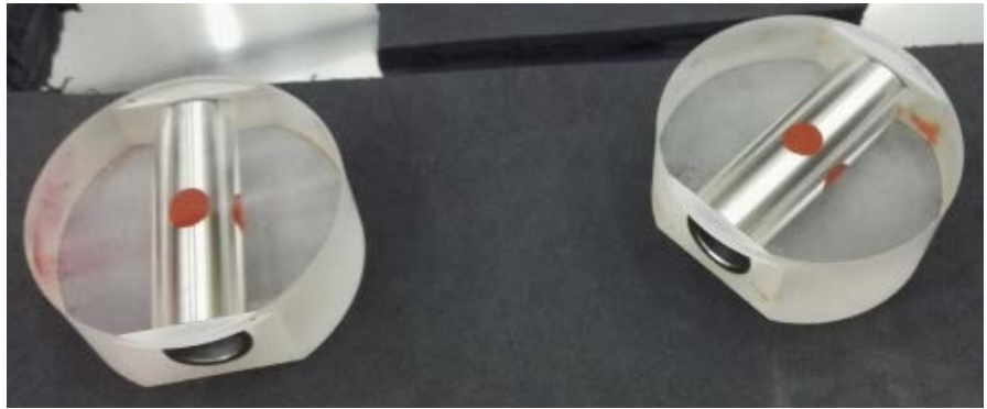
Figure 4. Surface figure specimen of Milbond.

Table 4 and Table 5 show surface figure error change using degassing epoxies. Table 6 and Table 7 show the surface figure error change using without degassing epoxies [4]. As can be seen from Table 4 to Table 7 , comparing degassing and without degassing, the average surface figure error increment change