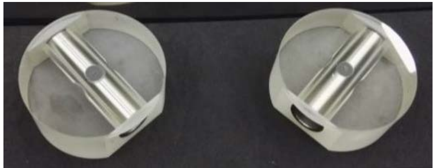
Figure 5. Surface figure specimen of EC2216.