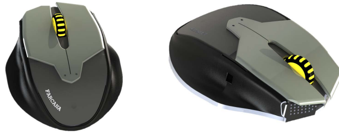
Figure 1. Farcana smart gaming input device.

rights of any individual or company ( Figure 1 ). We present a device that provides more immersive gameplay combining data from sensors processed by a built-in microprocessor capable of obtaining the gamer's heart rate. This smart gaming input device is executed in the form of a computer pointing device built as a computer mouse with PPG and motion sensors ( Figure 1 ). These sensors are attached to the device frame to have an accurate read of data and signals received from the players. In addition, all data are transferred to the cloud for processing and analysis. At the same time, the device system also includes an artificial intelligence system capable of analyzing all data received in real-time. This heart rate data is also used to identify problematic digital biomarkers for various diseases as HRV helps to pinpoint various humoral, neural, and neuro-visceral processes to identify various disorders of brain, body, and behavior.