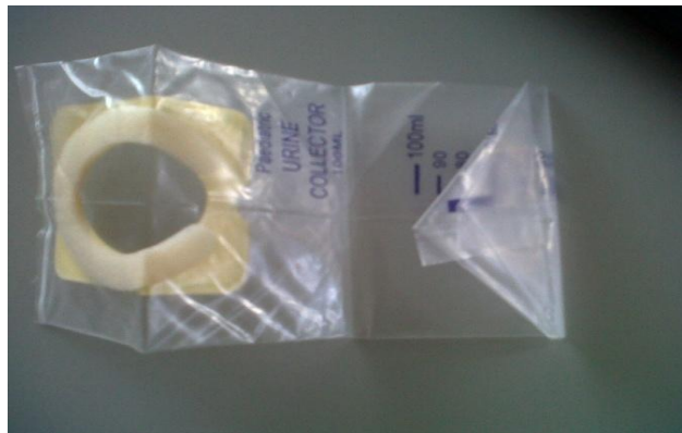
Fig. 2. Pediatric urine collector