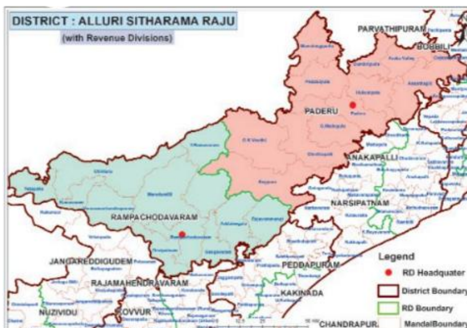
Fig. 1. Map showing study location

A primary product of the plant in rural communities is the toddy in agency area and in some areas sugar substitute called jaggery obtained from the juice from the flowers. Sap collected from the inflorescence is fermented with a crude, mixed inoculum of yeast to obtain toddy. This beverage can be distilled, as is coconut toddy, to prepare a more concentrated spirit.