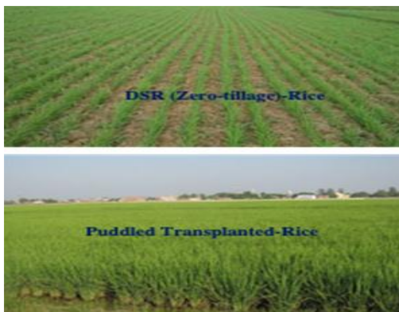
Fig. 2. Different methods of rice crop production in the IGP region

profit in areas with guaranteed water supply [23,51,14]. Early DSR reaches maturity 12 weeks before transplanted rice, lowering the danger of terminal drought and enabling the planting of a subsequent non-rice crop early [76]. Furthermore, DSR under zero-tillage systems, leaving agricultural residues on the soil surface, improves soil physical and chemical characteristics, enhances soil organic matter and water penetration rates, conserves soil moisture, and minimises soil erosion [35,15].