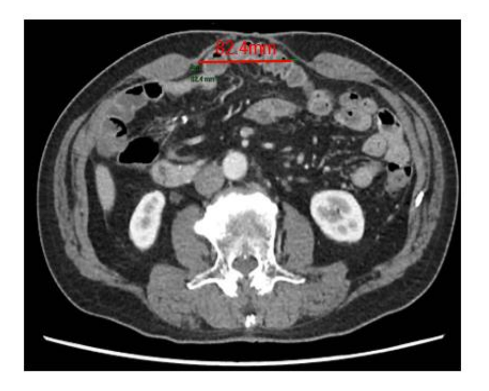
Fig. 1. CT showing 8 cm incisional hernia defect

Tu et al.; Asian J. Case Rep. Surg., vol. 7, no. 1, pp. 198-206, 2024; Article no.AJCRS.115778