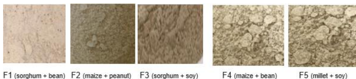
Fig. 1. Infant flour for different formulations

used immediately for the different analyses. The other samples were stored at room temperature (28 - 30°C) in a warehouse for 2 months. Each month samples are taken for the various analyses.