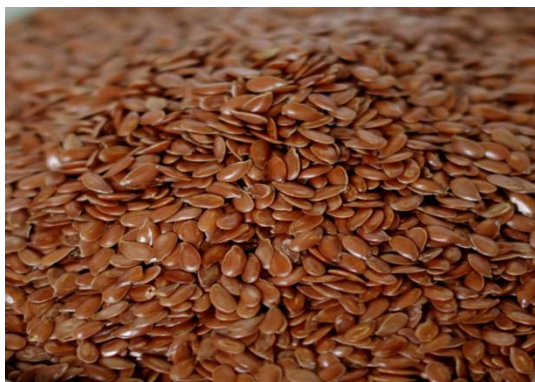
Plate 1. Image of flaxseed

plants have been used to treat various ailments [11]. One of such plant with potential health benefits is flaxseed, which has been studied for its ability to aid in glycaemic control [12,13,14]. Additionally, the use of flaxseed may be associated with a reduction in the risk of obesity and dyslipidaemia. These risk factors are known to contribute to the development of DM and insulin resistance. Therefore, the utilization of flaxseed could have positive effects on managing DM and related conditions [15].