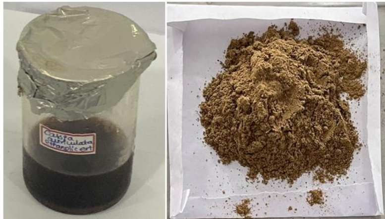
Fig. 1. Image showing the Synthesis Cassia auriculata ethanolic extract

to significantly inhibit granuloma tissue formation of serum lysosomal enzymes and lipid peroxides which also includes significant reduction in levels [44].